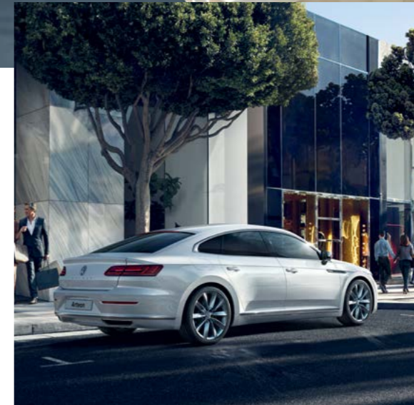
Model shown is Arteon Elegance 2.0 Itr BiTDI SCR 4MOTION with optional 19" 'Chennai' alloy wheels and Oryx White premium signature paint.