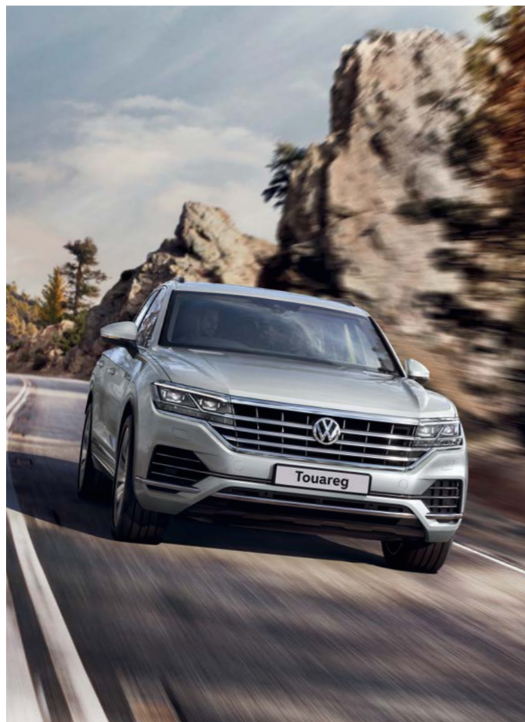
Model shown is Touareg SEL with optional 21" 'Suzuka' Dark Graphite diamond-turned alloy wheels, air suspension, 'IQ. Light' LED matrix headlights, headlight washers and metallic paint.