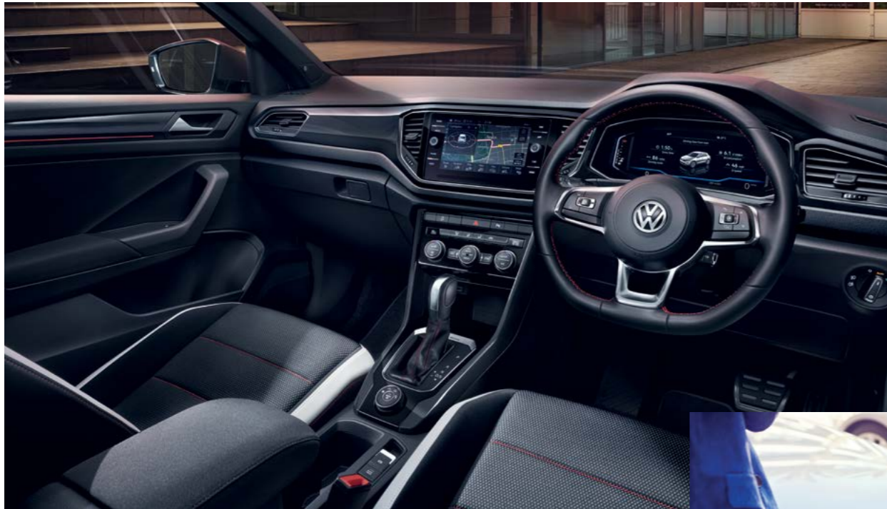
Interior shown is T-Roc SEL DSG 4MOTION with optional Sport pack, beats soundpack, carpet mats and metallic paint.