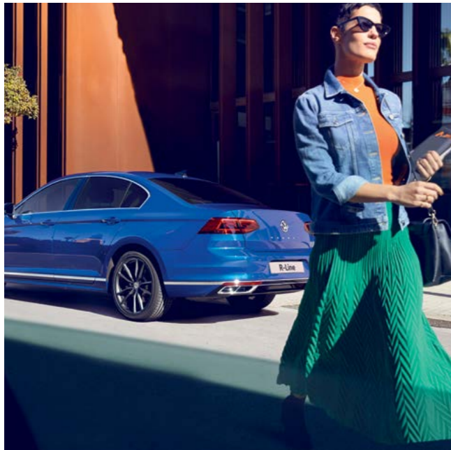
Model shown is new Passat R-Line with optional 'IQ. Light' LED matrix headlights, 19" 'Pretoria' Dark Graphite Matt alloy wheels and metallic signature paint.

When your vehicle is declared a total loss , please contact us . You will need your certificate of insurance and vehicle registration to hand. You can contact us :