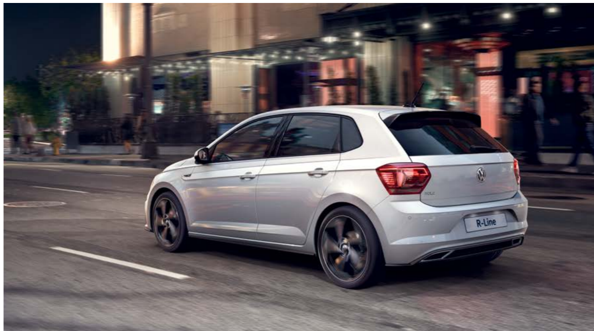
Model shown is new Polo R-Line with optional 17" 'Bonneville' Black diamond-turned alloy wheels and metallic paint.