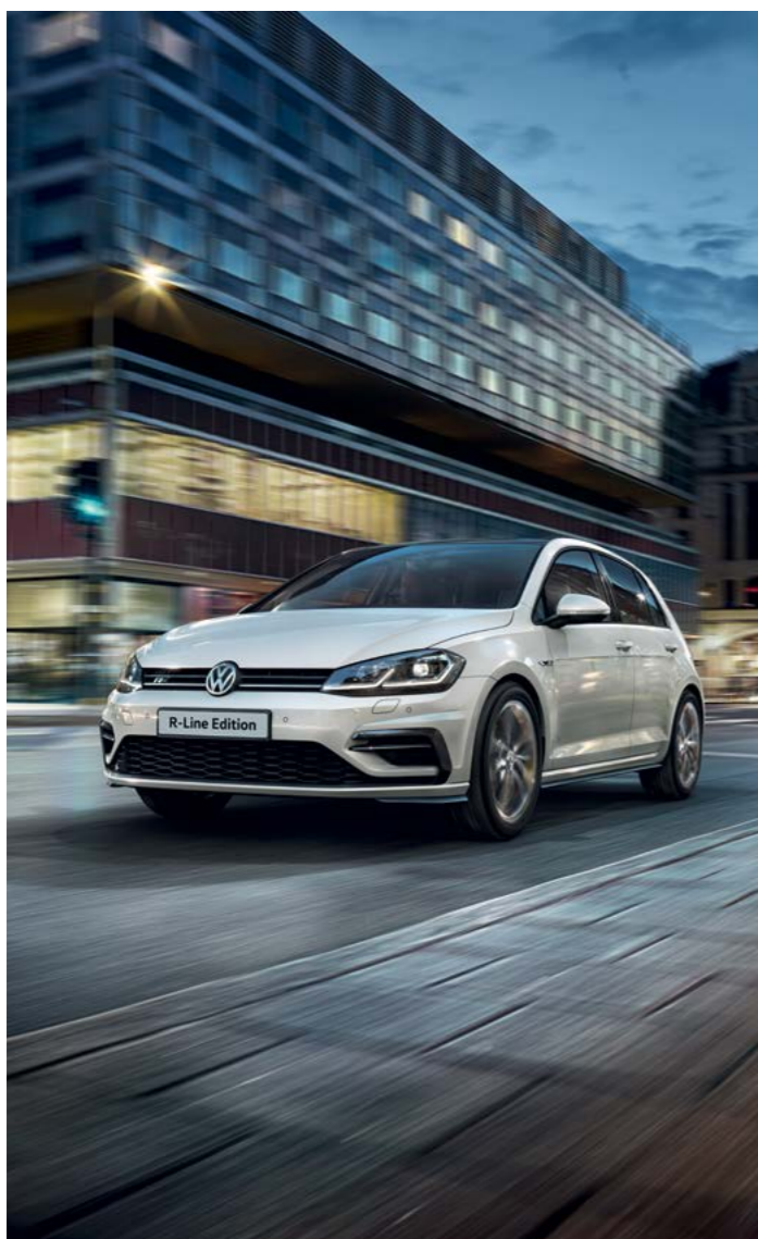
Model shown is Golf R-Line Edition with optional 18" 'Sebring' alloy wheels, panoramic sunroof and Oryx White premium signature paint.