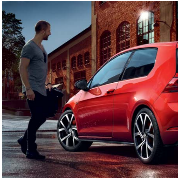
Model shown is Golf GTI Performance with optional 19" 'Brescia' alloy wheels and Tornado Red non-metallic paint.

These words have the following meaning throughout this policy, where highlighted bold: