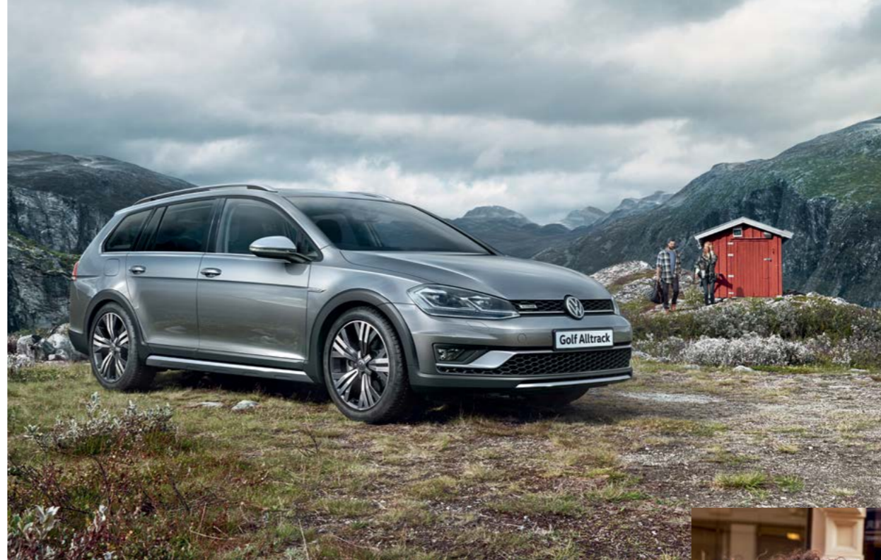
Model shown is Golf Alltrack with optional 18" 'Kalamata' alloy wheels, Winter pack and metallic paint.

If you have any difficulties reading this document, please contact the Customer Services Team.