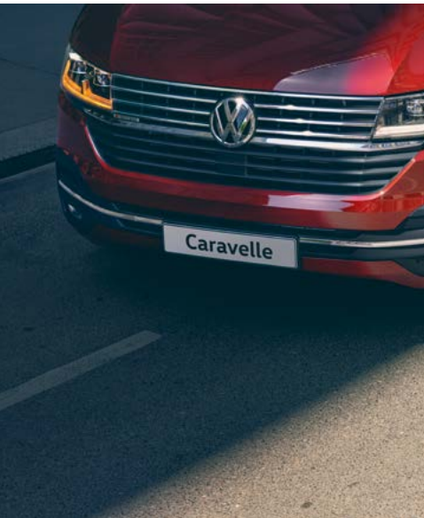
Images shown are for illustrative purposes only. Vehicles shown are not UK specification.