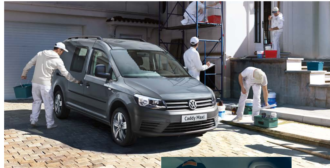
Images shown are for illustrative purposes only. Vehicles shown are not UK specification.

This information may also be shared with the police and other insurers for fraud prevention purposes.