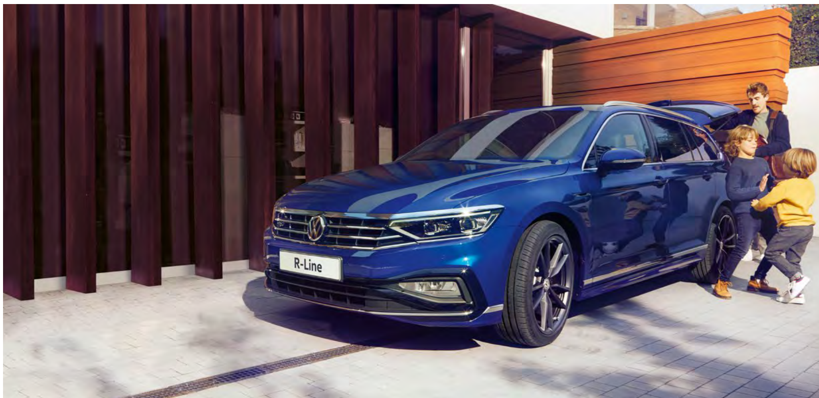
Model shown is Passat Estate R-Line with optional 'IQ. Light' LED matrix headlights, 19" 'Pretoria' Dark Graphite Matt alloy wheels, panoramic sunroof and metallic signature paint.