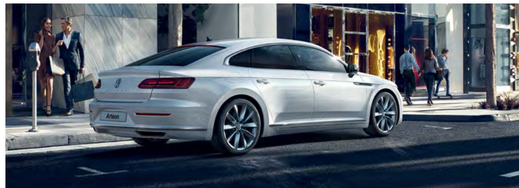
Front cover model shown is T-Roc Design with optional 18" 'Arlo' Adamantium Silver alloy wheels and metallic paint. Model shown on this page is Arteon Elegance 2.0 ltr BiTDI SCR 4MOTION with optional 19" 'Chennai' alloy wheels and Oryx White premium signature paint.