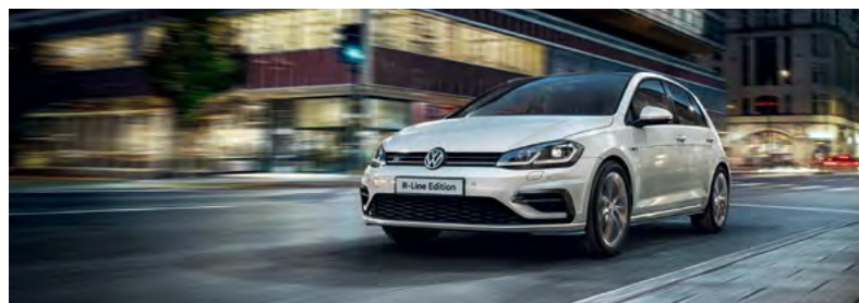
Model shown is Golf R-Line Edition with optional 18" 'Sebring' alloy wheels, panoramic sunroof and Oryx White premium signature paint.