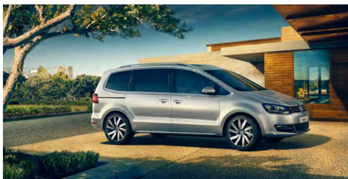
Model shown is Sharan SEL with optional 18" 'Marseille' alloy wheels, Xenon dipped beam headlights and metallic paint.

Volkswagen Extended Warranty, PO Box 869, Warrington, WA4 6LD.