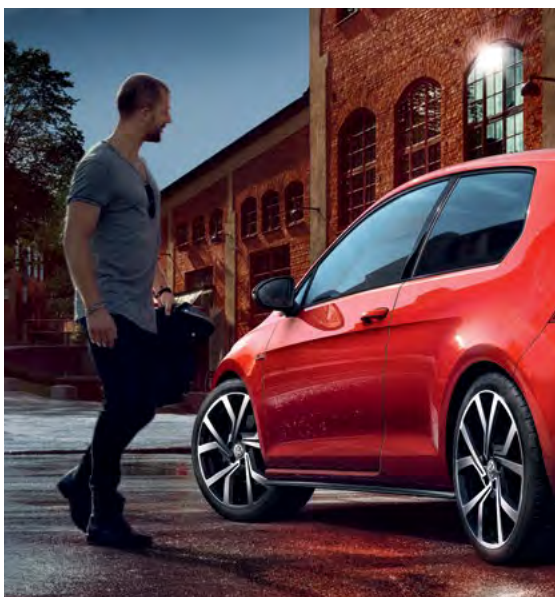
Model shown is Golf GTI Performance with optional 19" 'Brescia' alloy wheels and Tornado Red non-metallic paint.