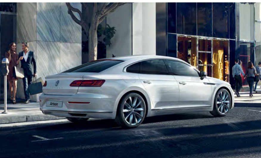
Model shown is Arteon Elegance 2.0 Itr BiTDI SCR 4MOTION with optional 19" 'Chennai' alloy wheels and Oryx White premium signature paint.