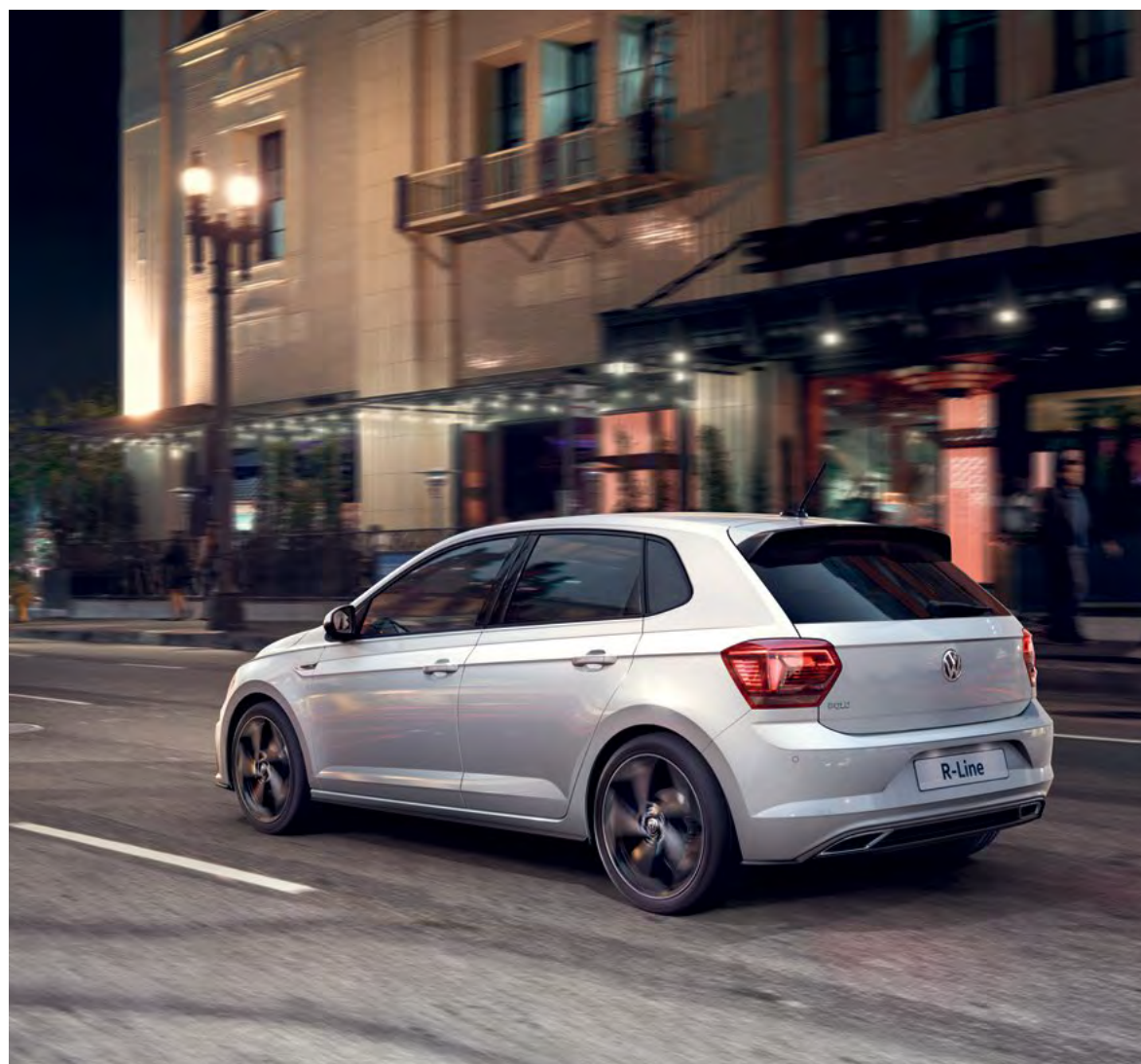
Model shown is Polo R-Line with optional 17" 'Bonneville' Black diamond-turned alloy wheels and metallic paint