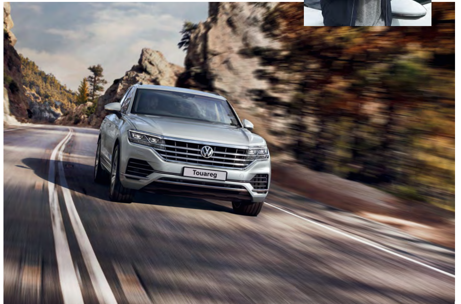
Model shown is Touareg SEL with optional 21" 'Suzuka' Dark Graphite diamond-turned alloy wheels, air suspension, 'IQ. Light' LED matrix headlights, headlight washers and metallic paint.