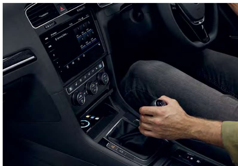
Interior shown is Golf GT Edition with optional Discover Navigation Pro touch-screen navigation/DVD infotainment system.