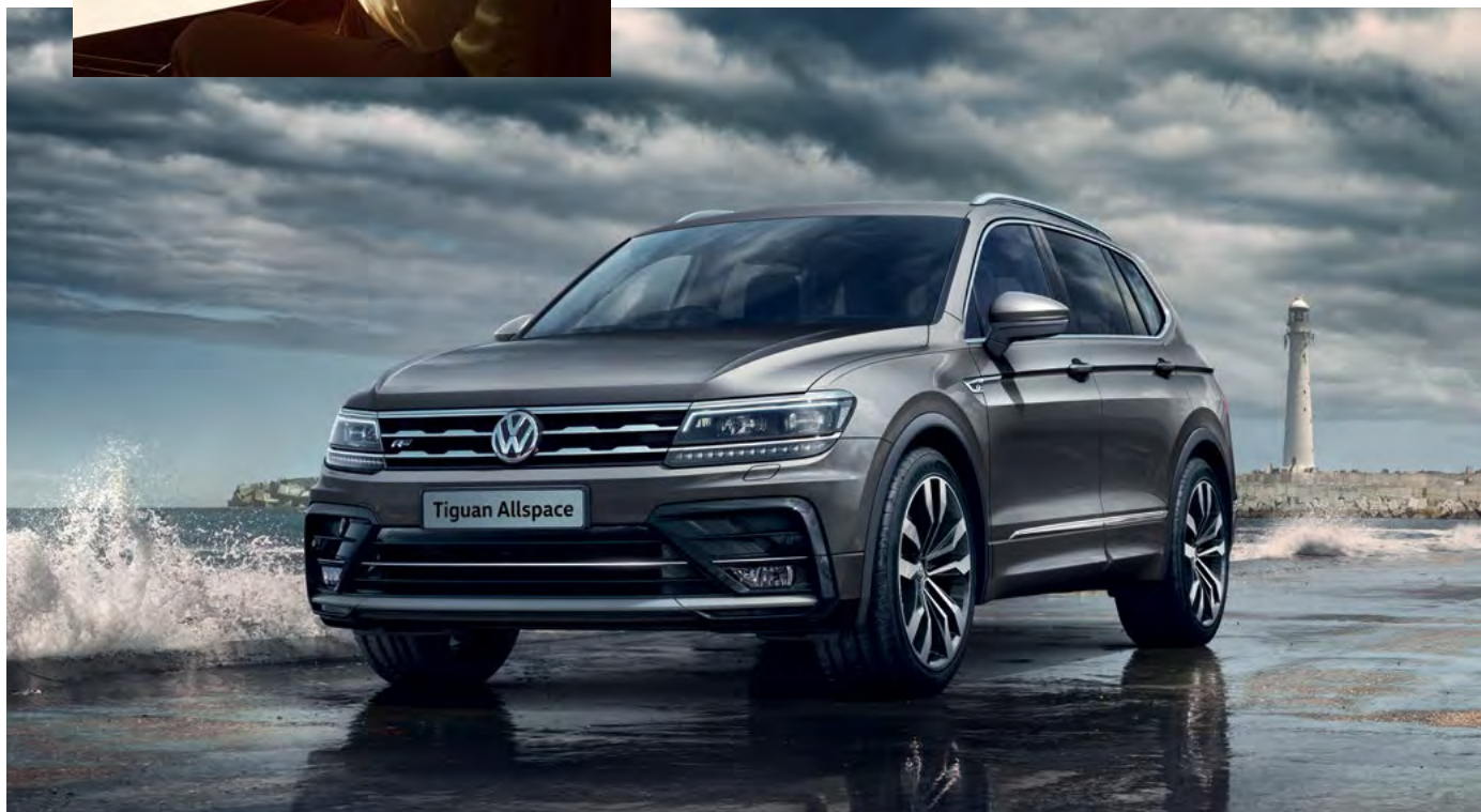
Model shown is Tiguan Allspace R-Line Tech with optional metallic paint.