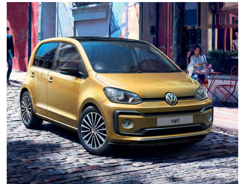
Model shown is High up! with optional 17" 'Polygon Black' alloy wheels, City emergency braking pack and metallic paint with two-tone black roof paint option.