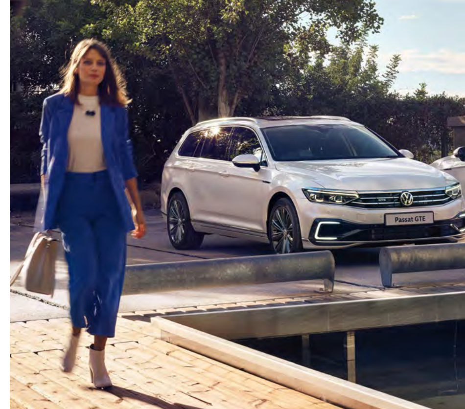
Model shown is Passat Estate GTE with optional 'IQ. Light' LED matrix headlights, panoramic sunroof, Head-up Display and premium signature paint.