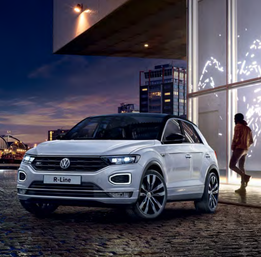
Model shown is T-Roc Design with optional 18" 'Arlo' Sterling Silver alloy wheels and metallic paint. Interior shown is Golf GT Edition with optional Discover Navigation Pro touch-screen navigation/DVD infotainment system.