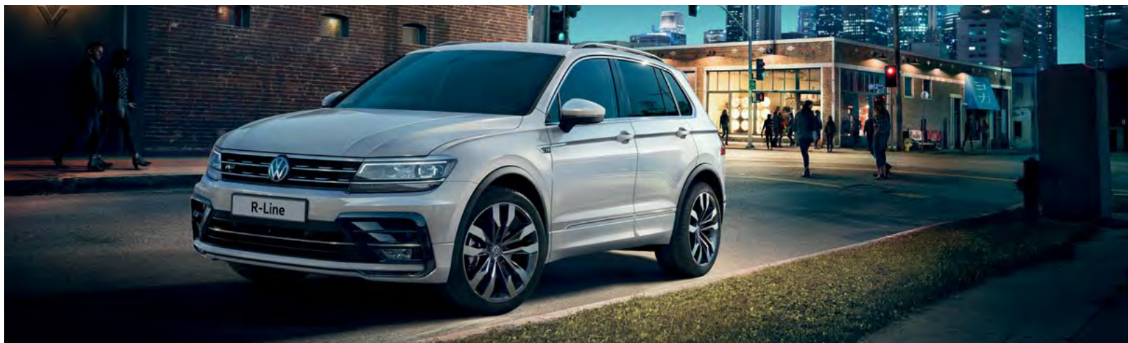
Model shown is Tiguan R-Line Tech with optional Head-up Display and premium signature paint.