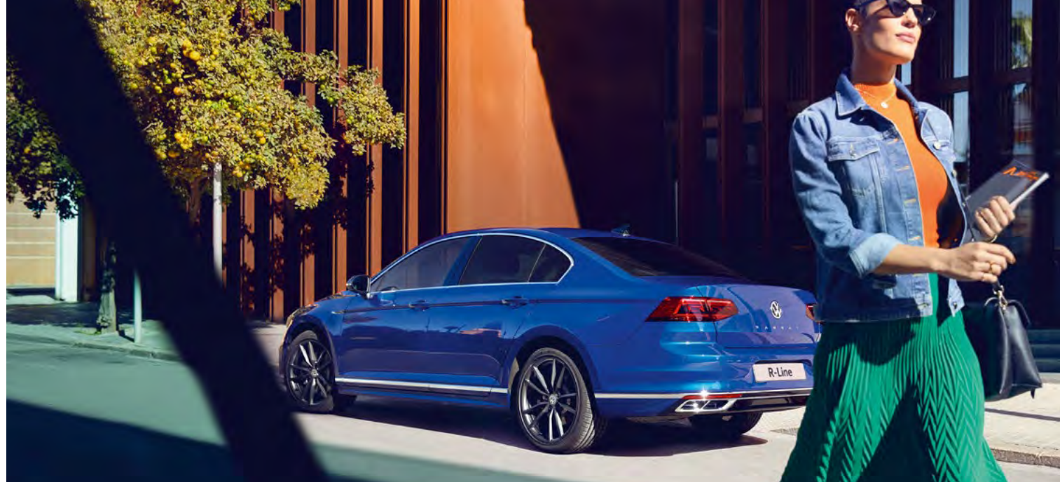
Model shown is Passat R-Line with optional 'IQ. Light' LED matrix headlights, 19" 'Pretoria' Dark Graphite Matt alloy wheels and metallic signature paint.