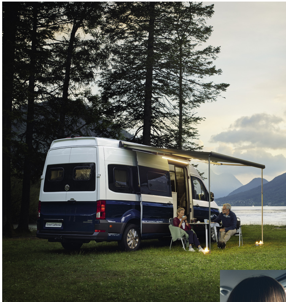
Images shown are for illustrative purposes only. Vehicles shown are not UK specification.