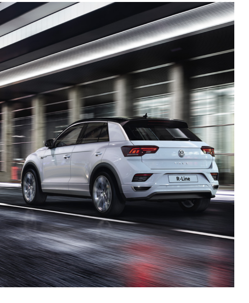
Model shown is T-Roc R-Line with optional two-tone black roof and Pure White non-metallic paint.