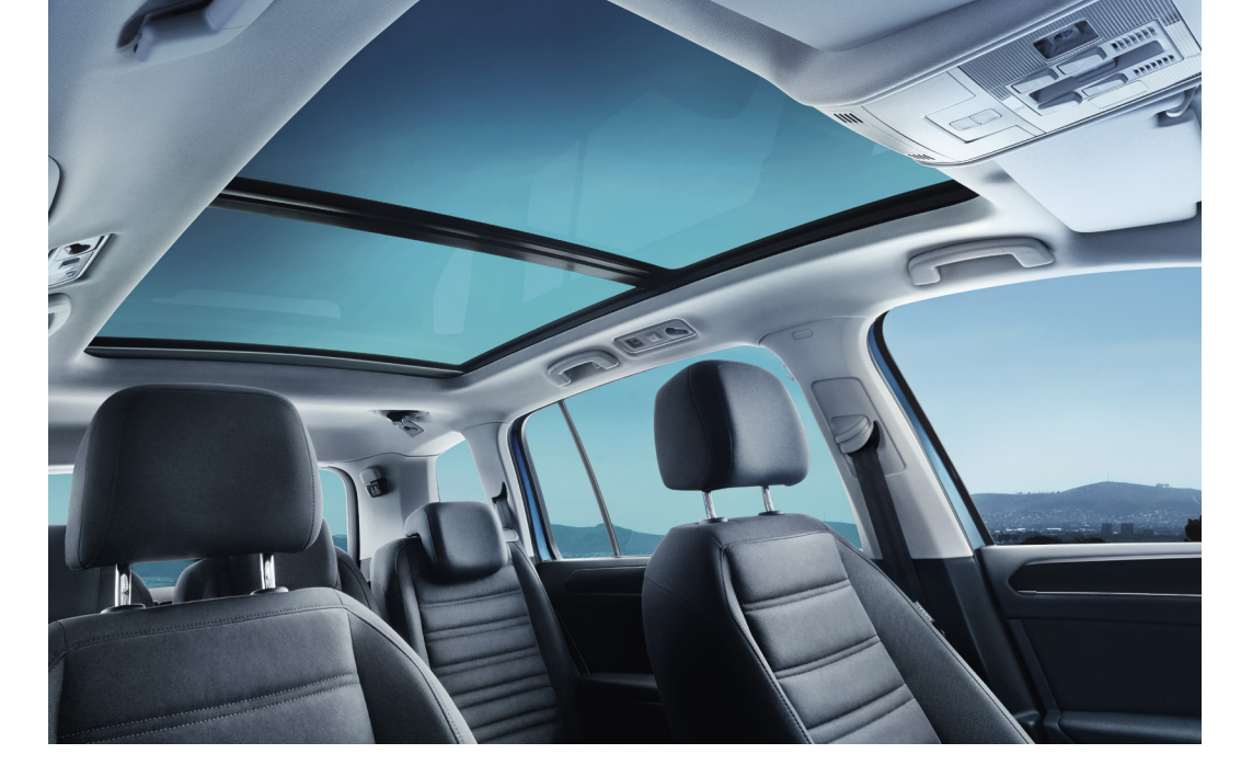
Interior shown is Touran SEL with optional panoramic sunroof, luggage restraint/net partition and metallic paint.