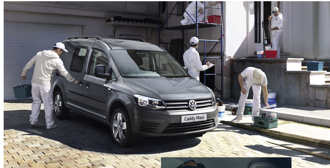
Images shown are for illustrative purposes only. Vehicles shown are not UK specification.

This information may also be shared with the police and other insurers for fraud prevention purposes.