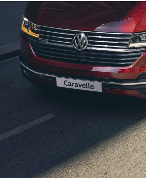
Images shown are for illustrative purposes only. Vehicles shown are not UK specification.